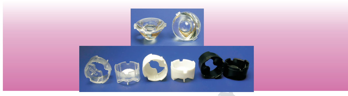
LuxDrive 20mm optics and holders

The LuxDrive Star K2 can be fitted with any of a wide range of optics, also offered by LuxDrive. Standard lens holders are clear, but white or black can also be specified. There are four standard illumination patterns available: spot (5°), medium(15°), wide(25°) and oval (5° x 20°). See the diagrams on page 5 for examples of typical ilumination patterns.